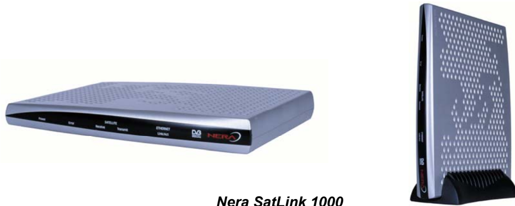
Nera SatLink 1000

The Nera SatLink 1000 is a DVB-RCS compliant Indoor Unit (IDU) designed for connecting a single user or an end-user LAN to a DVB-RCS satellite network. The design is compact, lap-top sized, making it well suited for placement on the office desk in a SOHO environment. The Nera SatLink 1000 contains the DVB-S/DVB-RCS modems, an industry standard IP stack, and Ethernet interface – enabling connection to the services offered by a DVB-RCS Hub without any other external units or adapters. The Nera SatLink 1000 can be configured with a range of different antennas and Outdoor Units (ODUs).